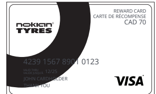
Illustration of the prepaid card as an example only. The received card can be different from that represented here.